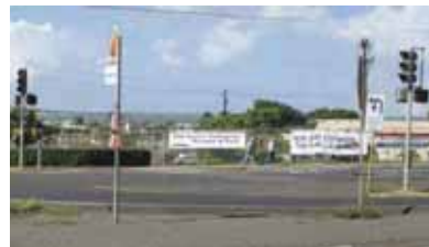
The existing entry to the Pearl Harbor Historic Sites Gateway has temporary banners and signs.