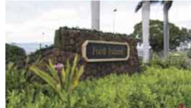
The design scheme of the Navy's Pearl Harbor gateways will be continued to visually unify the area.