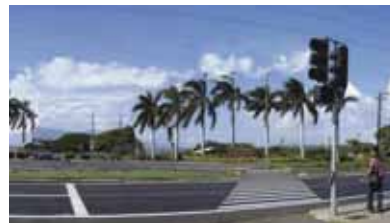
This photo simulation displays how the proposed entry would establish appropriate landscape treatments and pedestrian and vehicular access to the area.